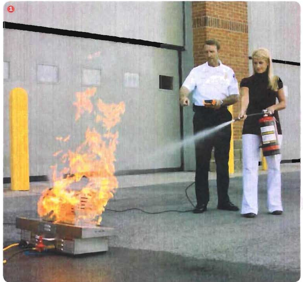
Class C Motor Prop in action Xtreme responds directly to the trainee's actions SmartExtinguishers are quickly and easily recharged in the field